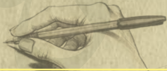
Illustration or More Examples

2 Examples of Typefaces from the Type Classification